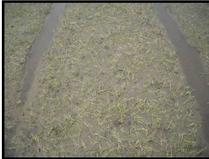
Factory pollution damages rice in the fields