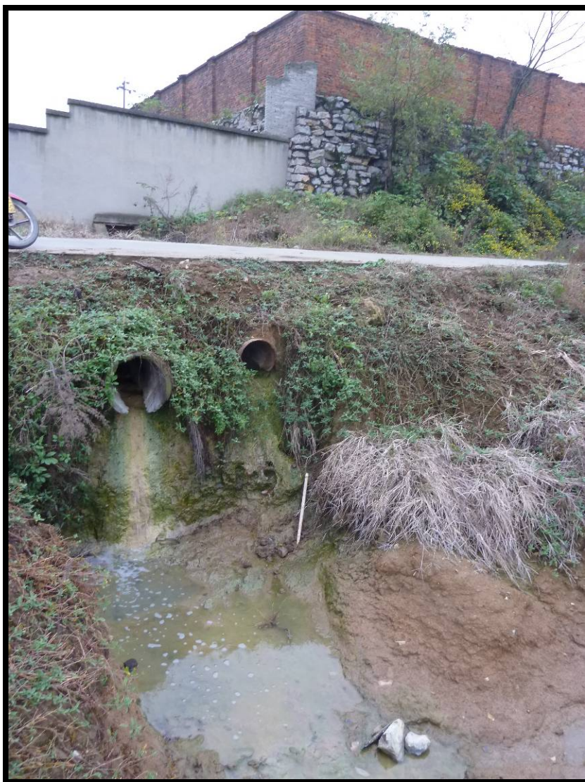
Waste pipe from Dasheng chemical dumps water with high arsenic levels

An ecological impact is the danger of geological collapse and disappearing ground water. According to villagers, many years ago, the river flowing through the village was much wider than it is now and they suspect mining activity is a possible cause.