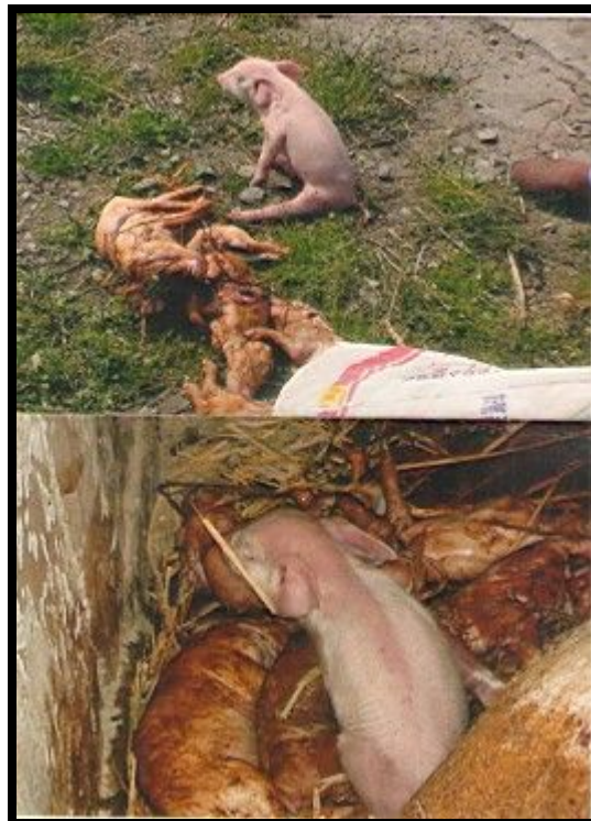
Deformed pigs appeared as pollution from the plant continued; photo by Boxun 9

Two examples of residents in close proximity to Dasheng who suffered serious damage from the pollution include Wei Kaizu who raised pigs and Yu Dinghai who raised poplar trees near the plant. In fact, Dasheng discharged waste water and other mining wastes directly into ponds located on the pig farm. Together with other community members they pressured local government authorities to take action. In response to community requests, local government authorities conducted sampling and testing which indicated that the damage could be caused by the factory, in particular the harm suffered by Wei Kaizu and Yu Dinghai. As a result, the local