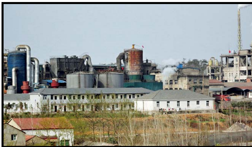
Dasheng Chemical in Zhongxiang 3

China produces nearly half of the world's phosphate fertilizer and exports approximately 20% of it to other countries. 1 The industry has grown rapidly despite the need for control emphasized in the 12 th Five-Year Development plan, with a 36% increase in production between 2011 and 2012. 2 Hubei Province is one of the principal phosphate fertilizer production areas in China and the location of Dasheng Chemical in Zhongxiang City – the subject of this case study. The Dasheng Chemical case illustrates the harms from pollution and how liability and compensation can go terribly wrong.