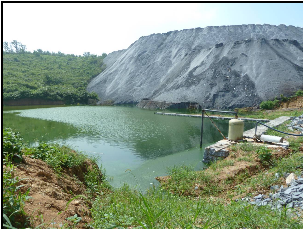
A new dump for phosphate waste with no treatment and direct environmental exposure; photo by Xie Xinyuan

dispersed to the surrounding environment. Project personnel also sent leachates from the new slag pile for third-party testing. The results show that fluoride levels of 1360 ppm which is more than 900 times higher than the national standard on surface water. Arsenic levels of 17.2 mg/L are 172 times higher than the national standard on surface water. In addition, the arsenic level is 3.4 times higher than the national standard on the leaching property of hazardous waste.