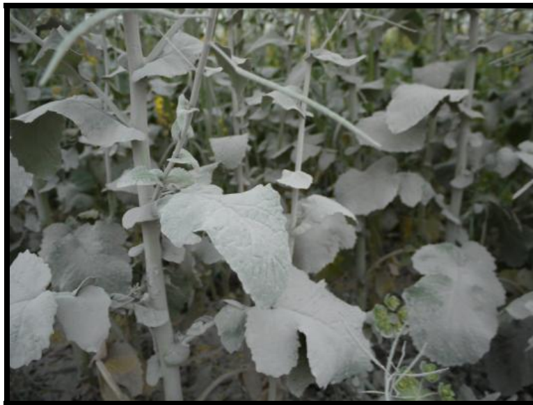
Phosphate dust covers plants in the area; photo by Marketplace 8

Day and night air emissions from Dasheng Chemical began to coat houses and plants with white powder. Vegetables, fruit trees and other crops turned yellow and died, livestock reproduction suffered, and people reported nausea. 4 5 As conditions worsened, pigs were born deformed and others simply died. 6 Crops such as watermelons became inedible so that pigs would not eat them and regional purchasers labeled rice from the village as poisonous and refused to buy it. 7 Farmers began a weekly protest at the factory to increase pressure on the company.