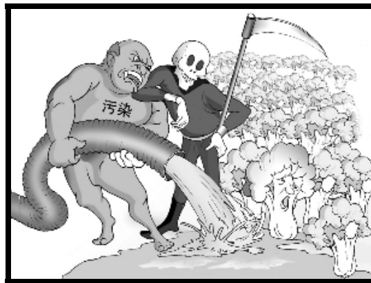
Cartoon from Hexun.com about pollution from Dasheng Chemical in Zhongxiang 12

judgment and asked for upper court for extension. According to the same law, an extension should not be for more than 1 month.