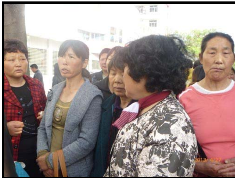
Defendants’ families wait outside court in Zhongxiang

According to Chinese Criminal Litigation Law, the judge must issue a decision within one and a half months of a hearing. However, on the due date of 14 June, 2013, the court had not made any